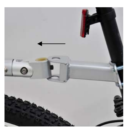
STEP 11 Maintenance

1. Inflate tires with a hand or foot pump to the correct PSI reading shown on the tyre.